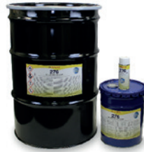
IL & MRO