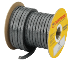
Packing & Gaskets