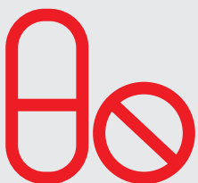
Pharma & Food

Every industry faces its own challenges. But they all share one essential need: safe, efficient, and reliable rotating equipment. Drawing on decades of hands-on experience across diverse sectors, our specialists combine deep application and process expertise to deliver the right solution.