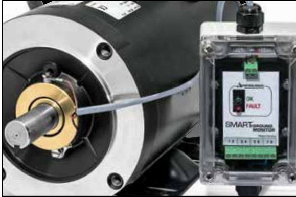
The Smart CDR™ connected to the Smart Ground Monitor™ provides users with instant feedback on shaft grounding performance.