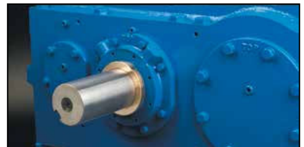
Inpro/Seal Bearing Isolators are installed on motors, pumps, pillow blocks, gearboxes and many other types of rotating equipment.