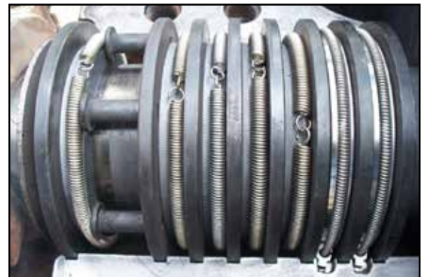
Typically, two Sentinel FBS's are installed in each gland box to provide superior sealing protection.