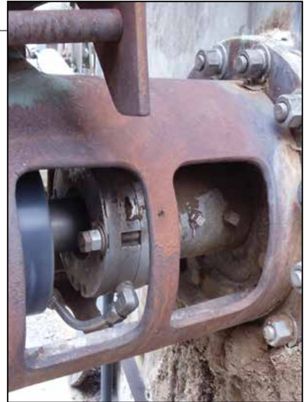
A stainless steel Air Mizer shaft seal installed on a side entry agitator eliminates product waste and contamination.

Inpro/Seal Air Mizer's unique non-contacting designs have no wearing parts and are intended to last the lifetime of your equipment.