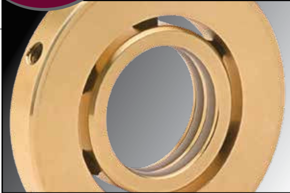
The Inpro/Seal Smart CDR and Smart MGS use proprietary conductive filaments to divert harmful stray shaft currents away from the bearings to ground.

Inpro/Seal Smart Shaft Grounding maximizes equipment reliability, reduces costly maintenance and minimizes unscheduled downtime.